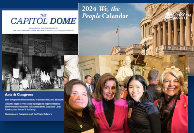
2024 We, the People Calendar

To book a tour, contact: tours@uschs.org .