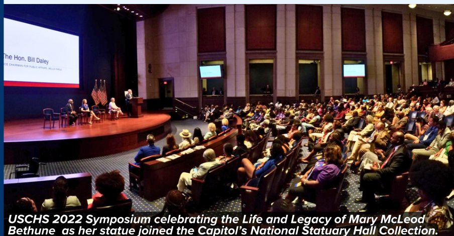
USCHS 2022 Symposium celebrating the Life and Legacy of Mary McLeod Bethune as her statue joined the Capitol's National Statuary Hall Collection.

Additionally, the Society produces a weekly newsletter, daily "On This Day in History" social media posts, and maintains an online history blog.