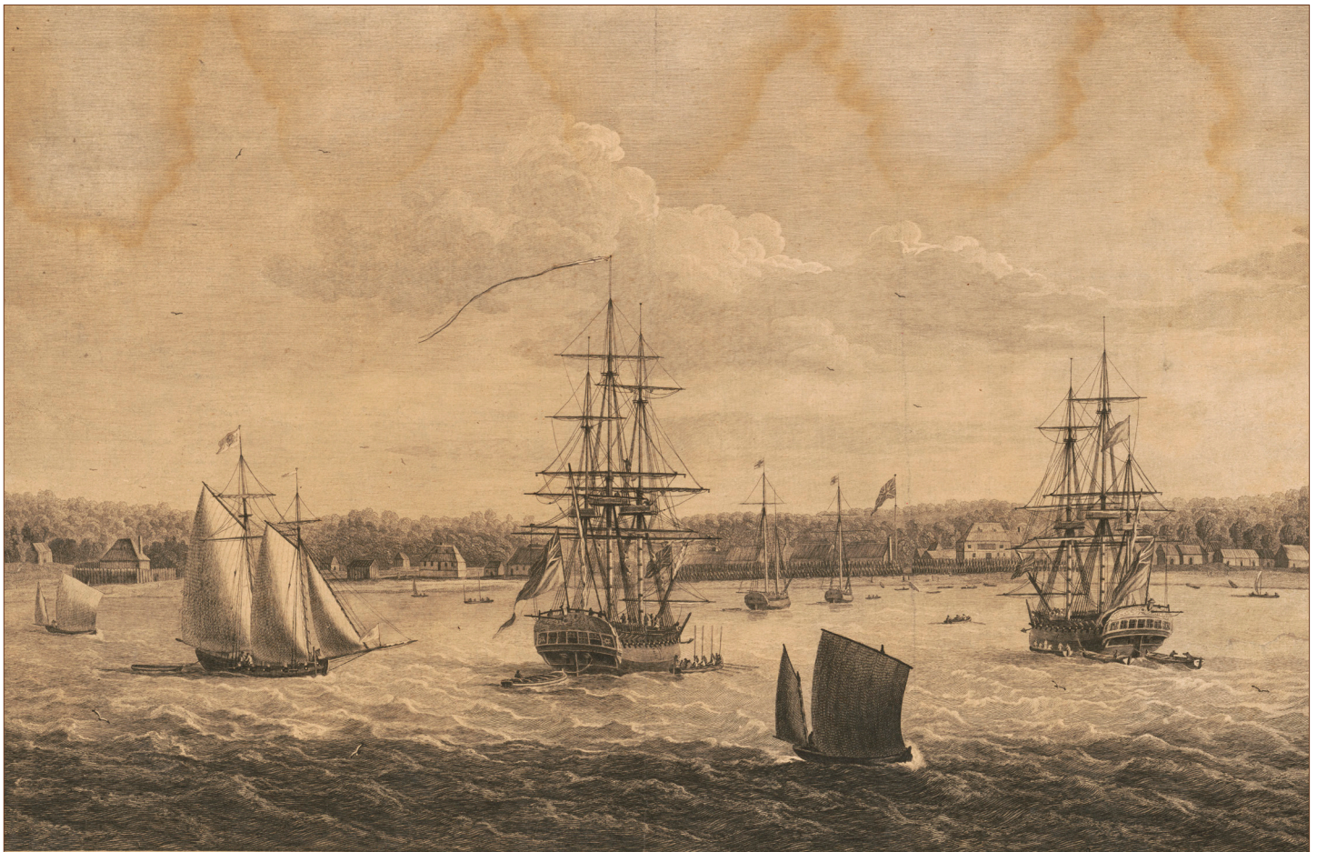
Fig. 4. This anonymous View of Pensacola, in West Florida (London, 177?), presents an idealized and highly glorified view of the modest port to highlight instead its strategic military and economic importance in the British Empire—and hence, the importance of Gálvez's victory.

Increasingly impatient with the old generals in Havana, Gálvez decided to go himself to Cuba to try to speed things up. After a series of never-ending war councils he managed to get most of the troops and ships he needed, and in October 1780 the expedition departed for Pensacola. When a furious hurricane hit the fleet, sinking several ships and damaging or dispersing most of the rest all around the Caribbean, the old generals saw it as the triumph of reason