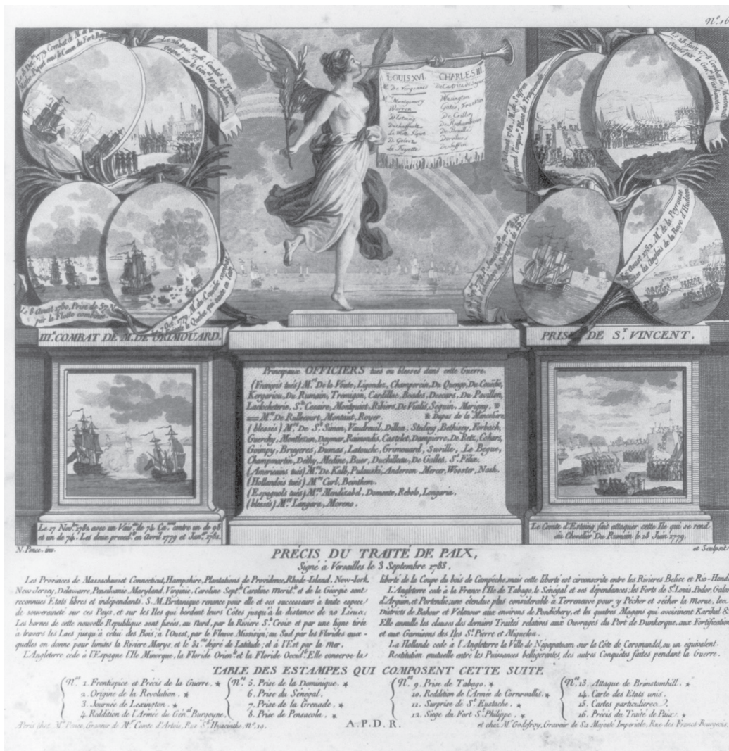
Fig. 7. In Précis du traité de paix , another French engraving by Nicolas Ponce (Paris, ca. 1784), medallions depicting notable battles of the Revolutionary War, such as Trenton and Monmouth, frame winged Victory trumpeting a scroll of heroes' names that includes Gálvez among the likes of Lafayette, Rochambeau, Benjamin Franklin, and Horatio Gates, victor of Saratoga.