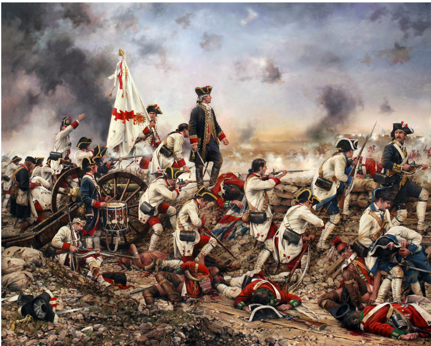
Fig. 6. In contrast to fig. 5, this view of the siege of Pensacola, by the hyper-realist history painter Augusto Ferrer-Dalmau, yields a fanciful center stage to Gálvez in the successful storming of a British rampart but adds the grim reality faced by the common soldiery. British casualties included several Native American allies.

of Louisiana, hoisted the flag of admiral of the fleet, and ordered it to head directly to Pensacola. To the surprise of most present, especially the naval officers, the Galveztown entered the bay with only minor damage. The British guns could not hit her since their placement on the top of the so called Red-cliffs prevented aiming them at a ship sailing close to the shore. At the time, Gálvez presented his actions as how “fortune befriends the bold” (quoting Virgil’s Aeneid ). It was not the first time, nor would it be the last, that fortune would come to Gálvez’s rescue. For this action, the king later rewarded him with the motto “I, alone” for his coat of arms. 18