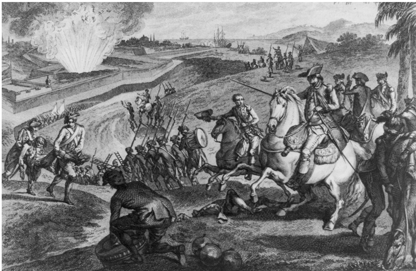
Fig. 5. The Prise de Pensacola, a French engraving by Nicolas Ponce (Paris, 1784?) imagines the crucial moment during the siege when a Spanish cannonball hit and ignited the powder magazine in the Queen's Redoubt, a formidable link in the British defenses. This is probably the most popular contemporary image of the siege.

The next phase was to be more difficult. In order to take the troops to the mainland, the ships needed to bypass the British defenses. The navy did not want to expose their ships in what they considered to be a suicide mission. Gálvez could not give direct orders to the navy since it was just assigned to the expedition but not under his direct command. He went aboard the small packet-boat Galveztown , 17 a privateer which was under Gálvez's direct command as governor