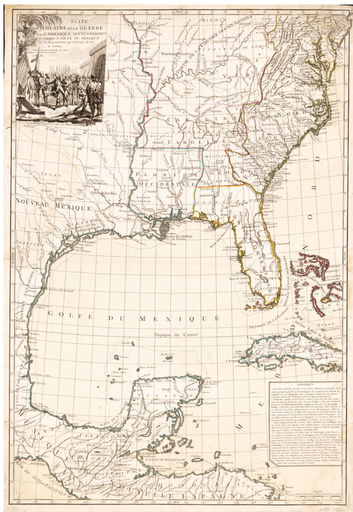
Fig. 2. Suite du Théâtre de la Guerre dans l'Amérique Septentrionale y Compris le Golphe du Mexique (Paris, 1782), by Louis Brion de la Tour, shows the central importance of Gálvez's stronghold of Louisiana in any military operations along the Gulf Coast—Britain's vulnerable southern flank throughout the Revolutionary War.

upon every occasion that has presented since your Excellency's accession to the Government of New Orleans & Louisiana. 2