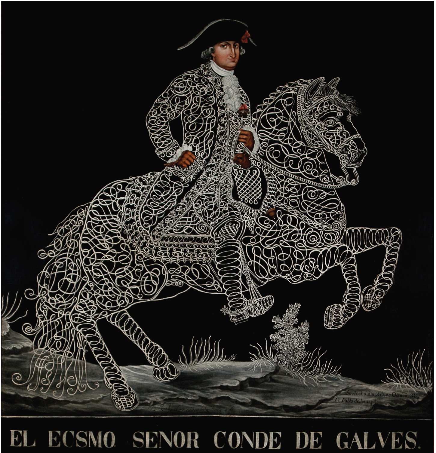
Fig. 1. Equestrian Portrait of Viceroy Bernardo de Gálvez (oil on canvas, 1796), by Fray Pablo de Jesús y Jerónimo

Willing was able to sell the booty of his controversial expedition against Loyalist settlements along the Mississippi in an auction in New Orleans. All this much-needed assistance by Bernardo de Gálvez to the revolutionaries' cause was officially recognized by the authorities of the new United States of America. In a letter dated 12 June