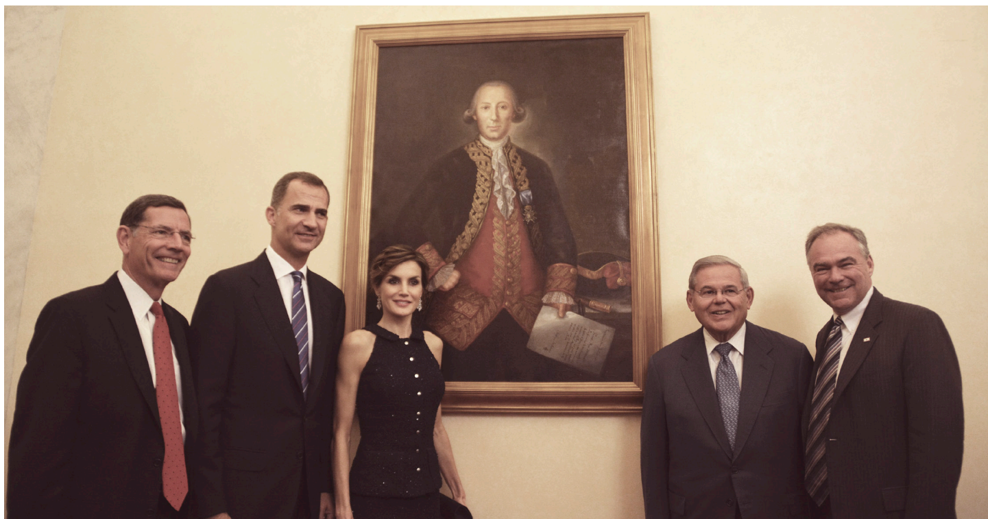
Fig. 10. HM King Felipe VI and HM Queen Letizia viewed Gálvez's portrait in the Senate Foreign Relations Committee Room during their first official visit to Washington, D.C., on 16 September 2015. Joining them were (from left) Senators John Barrasso (WY), Robert Menendez (NJ), and Tim Kaine (VA).

While most of Gálvez's energies were consumed in dealing with the humanitarian crisis faced by New Spain, he also addressed several profound and long-lasting reforms. Among them, and arguably the most important one, was the Instruction for the Government of the Internal Provinces of August 1786, which laid the foundation of a new policy concerning the expansion and settlement of the northern frontier of Mexico, today's southern states of the United States. 28